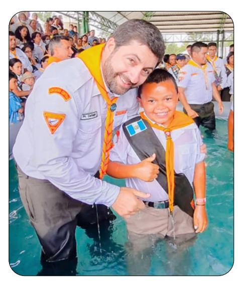
A Pathfinder is baptized at Los Pinos.