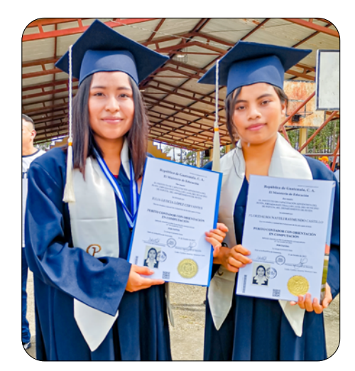
Two of the 2022 graduates from ICAP.